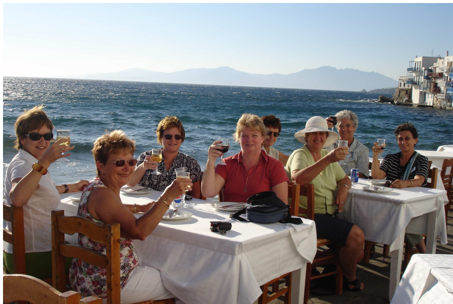
2007 Ladies group enjoying a drink at 'Shirley Valentines Bar' Mykonos.